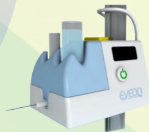
Intuity® Ject Pro

Intuity® Mix smart preparation Platform offering automated preparation devices